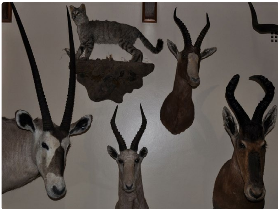
Figure 1: The blank stares of mounted trophies including springbok and gemsbok, and a wild cat from the farm where I stay during my fieldwork in South Africa and where I began this article, a far cry from the circle of attentive minds I encountered at Erice.

At Erice I faced not a wall of blank staring eyes but a circle of alert faces and brilliant minds. When I learned that at the end of each session at Erice we would be asked to sit in a circle to engage in discussion I will admit that I was a bit skeptical that this would amount to very much, but soon found myself enmeshed in lively discussion, and if matters ever flagged then Yadin Dudai was ready to goad participants into a reaction!