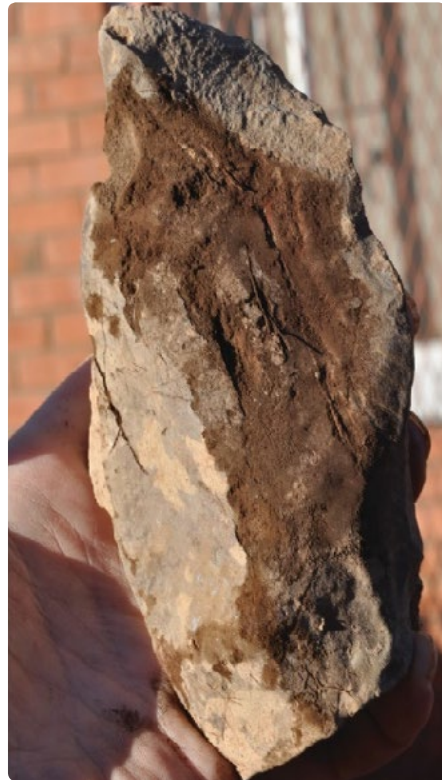
Figure 3: The handaxe with traces of flake removals during the process of manufacture approximately one million years ago.